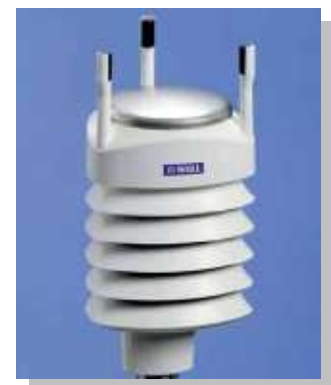
Vaisala WXT 520 weather transmitter