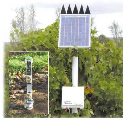
Stand Alone Soil Moisture Monitoring Solution

E-mail info@peakmonitoring.com.au Internet www.peakmonitoring.com.au