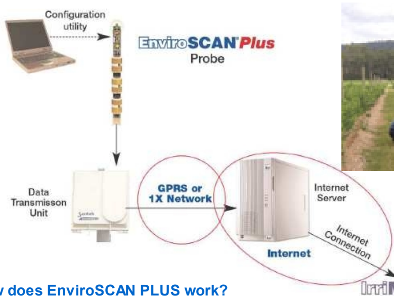
EnviroSCAN PLUS unit in Blueberries.

EnviroSCAN PLUS is a soil moisture monitoring system which transfers data to the end user via the Internet. The end user may then download the data for analysis and chart viewing.