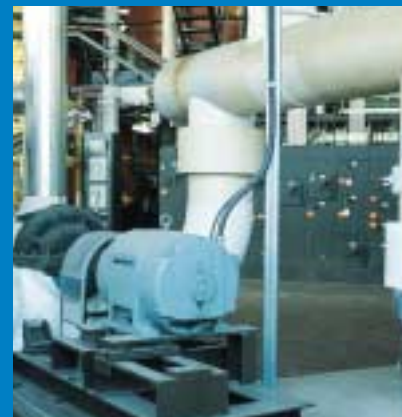
Long Distance Transmitter A733